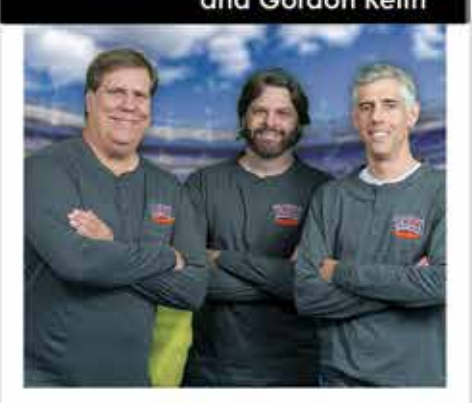
"The Musers" The Ticket, Sportsradio 1310 AM & 96.7 FM Dallas, TX